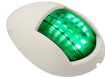
Part Number 52WR - Blister