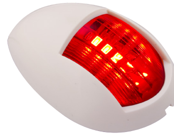
Part Number 52WW - Blister

ATAC Compliant 100% Waterproof 5 Year Warranty