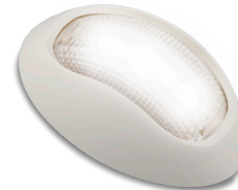
Part Number 52WG - Blister